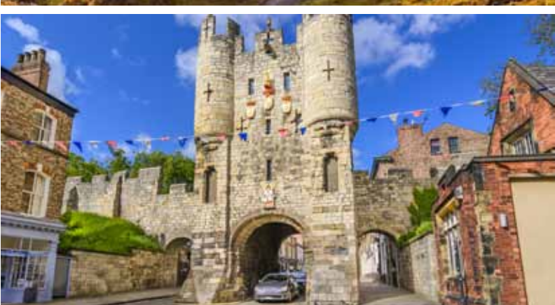
Extension Tour of England June 4 – 8, 2019